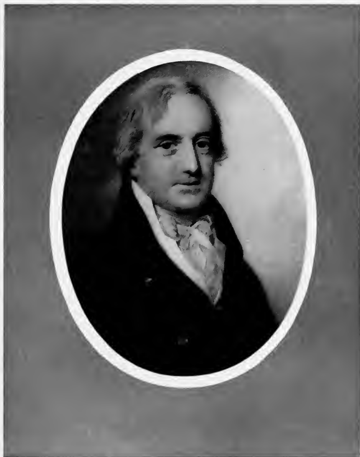
EARL BEAUCHAMP BY GEORGE ENGLEHEART (1805)